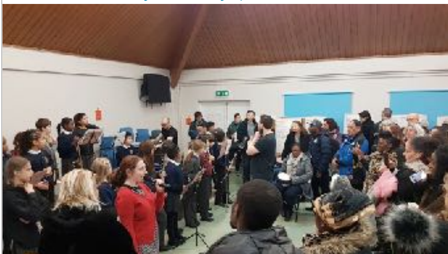
Launching the KOV Neighbourhood Plan with the community and being entertained by junior wind band, " In Harmony "

We were entertained by two local musical talents - Vauxhall Voices , and the junior wind band from In Harmony . (see links and article below for more info.)