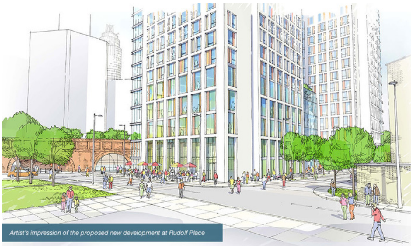
Artist's impression of the proposed new development at Rudolf Place